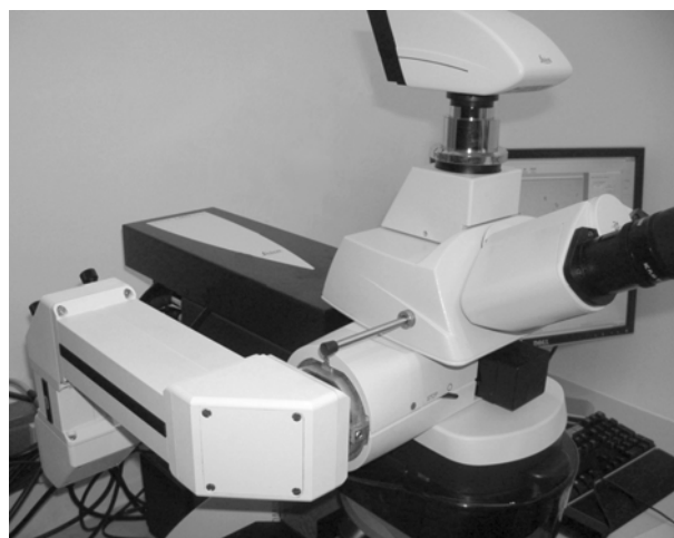
Installed on a Leica microscope

The 1070 nm fibre laser gives a stable high quality TEM 00 beam with an M 2 of 1.05. This high beam quality when used with high NA microscope objectives gives the tightly focused Gaussian spot required for efficient optical traps it both XY and Z directions. Variable power is available for changing the strength of the optical trap.