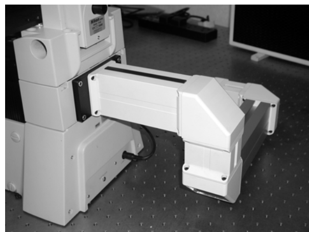
Fitted to a Nikon microscope