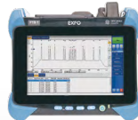
Optical Spectrum Analyser FTBx-5235