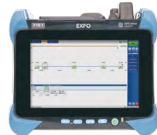
xWDM OTDR FTBx-740C