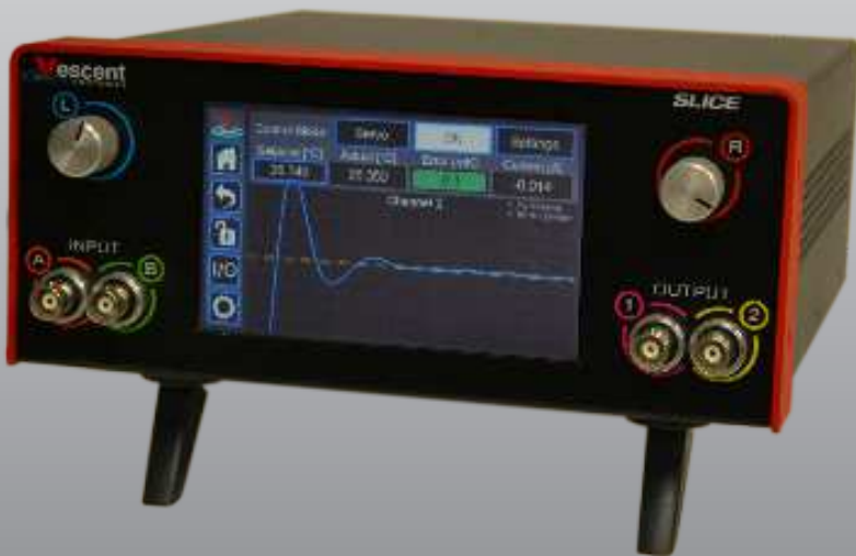
SLICE-QTC temperature controller

With compliance voltages up to 18 V and current outputs up to 6 A, our proprietary low-noise power supply technology makes it easy to control a variety of different plants. DC control (not PWM) means high short-term stability and no radiated noise.