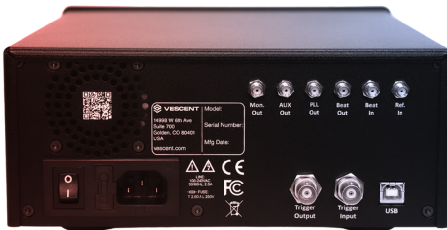
SLICE-OPL Back Panel