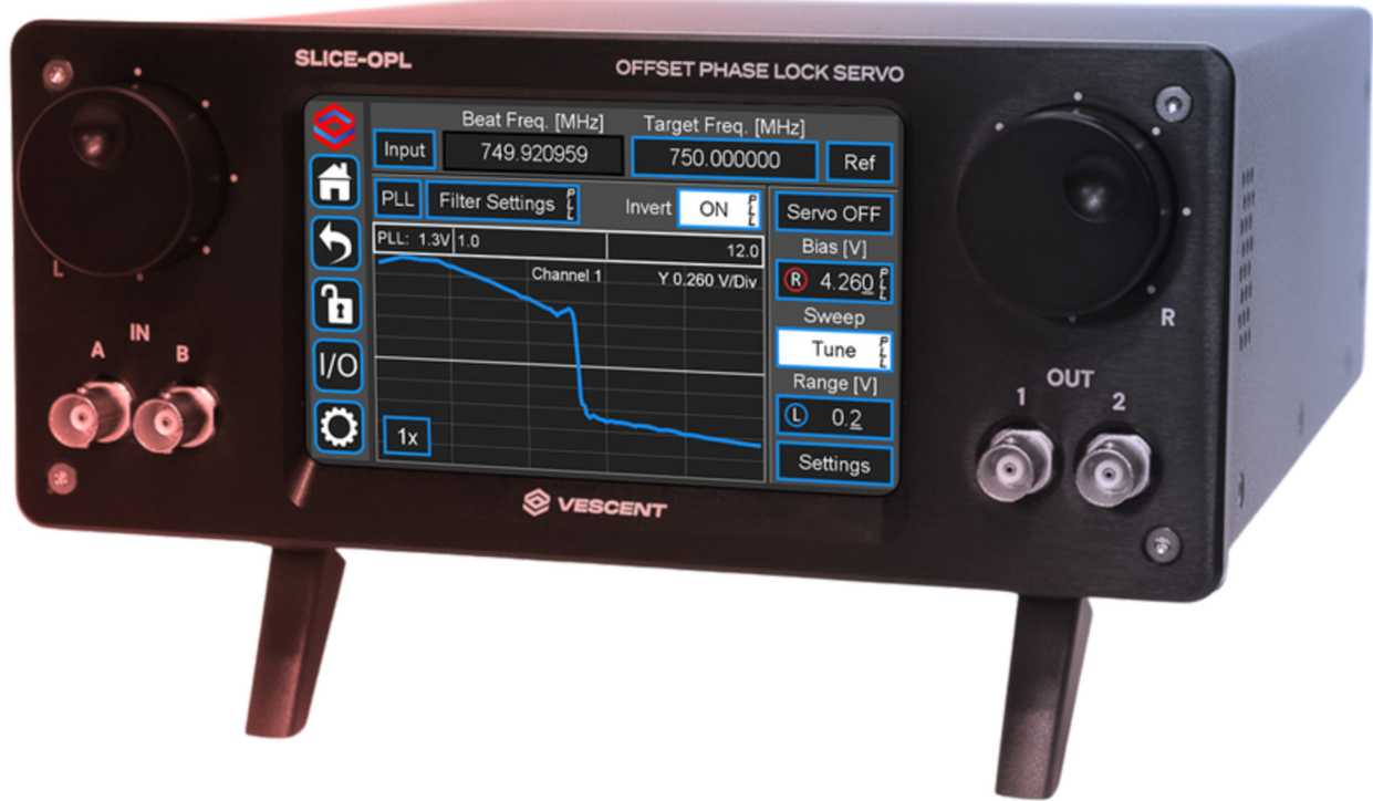
SLICE-OPL Offset Phase Lock Servo

The SLICE-OPL Offset Phase Lock Servo is designed to precisely control and quickly adjust the frequency detuning between a master and a follower laser.