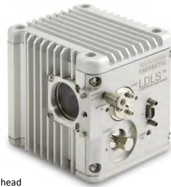
EQ-99X lamp head

The EQ-99X laser-driven-light-source from Energetiq Technologies utilizes a diode laser to drive a high-intensity plasma, which emits light from 170nm through visible into near infrared. It provides life-time an order of magnitude longer than traditional lamps. Its supreme stability allows to work without an input slit.