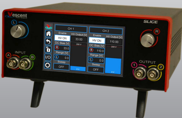
SLICE-DHV High-Voltage Amplifier

The SLICE-DHV is a SLICE of our Integrated Control Electronics Line: a dual-channel low-noise, high-bandwidth amplifier for controlling piezoelectric transducers. Designed for controlling pzt-driven tuning elements in ECDLs and cavity length control systems, it will interface easily with home-built or 3rd-party laser systems allowing optimum control.. The SLICE-DHV features exceptionally high bandwidth for small signals and excellent noise properties making it well-suited to demanding micro-motion & driving applications.