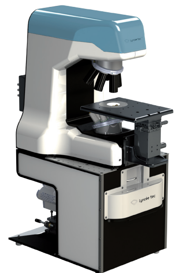
Transmission DHM® combined with a Fluorescence module