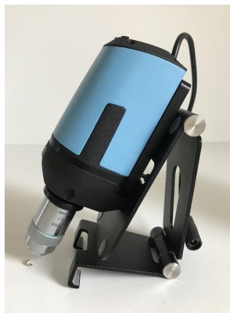
Figure 3 – IndiGo spectrometer with the Raman add-on equipped with a 532 nm laser and a 40X microscope objective for diamond testing.

The IndiGo is a compact and affordable device for performing Raman or photoluminescence analysis on diamonds and other gems. Laser excitation can be tailored to target specific needs. The GoyaLab mobile app enables analysis with a simple smartphone. Contact us for more information.